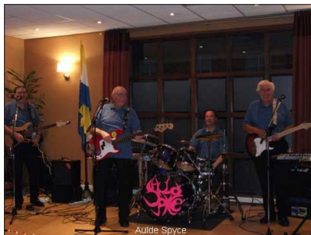
Aulde Spyce provided the music